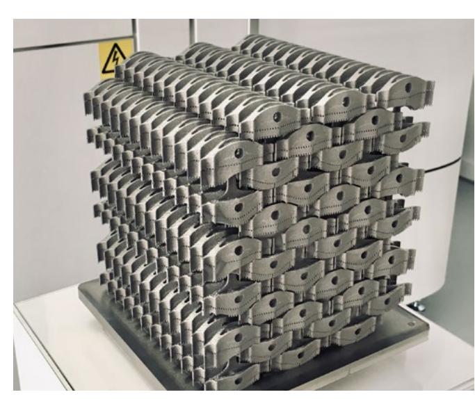
Stacked AM build plate at Metron

Diversifying into aerospace was an obvious next step, but this presented Metron with a challenge; how does the company convince potential aerospace customers that it can conform to aerospace quality requirements, when its quality system has been developed around the stringent, but different requirements of other high performance market sectors? Having acquired AS9100 RevD certification, Metron now needed to understand how to make its AM quality processes and procedures aerospace-ready.