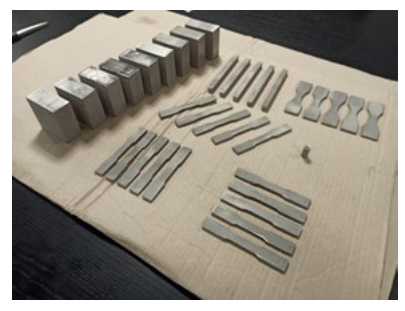
Test specimens printed by Metron