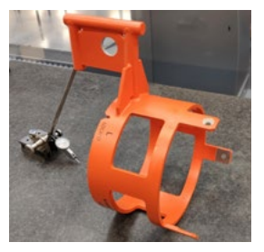
Original rotation collar

After completing a Manufacturing Readiness Review, a prototype rotation collar was built by Renishaw on an AM500Q LPBF machine, together with a number of material test coupons. Some issues were experienced including banding around the diameter and some build plate deformation due to the large size of the build. Following further design changes, a second build showed improvement in these defects, although some further development work was recommended, should the part proceed to production. Regular review meetings throughout this work helped ensure the effective transfer of AM knowledge to SPE engineers.