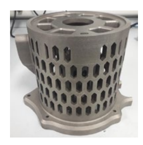
First build of rotation collar

The DRAMA programme has taken SPE's strategic AM commitment to the next level. In 2020 we completed the first stage of our metal AM ambition through the programme and also invested in our first 3DM machine. The market appetite for metal AM parts is increasing - SPE are a lot closer to being "match ready" on our plan for future metal AM capability thanks to the project.