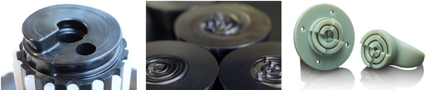
Evolution of Rotite® components (left-to-right): Injection Moulded; Machined; Polymer AM

Rotite Technologies have previously made Rotite® configurations using injection moulding, EDM, five axis machining and polymer Additive Manufacturing (AM) - however they had a desire to understand if and how they could use metallic AM methodologies in order to appeal to wider markets. In this DRAMA project, Rotite Technologies sought to understand the opportunities and challenges presented by metallic AM. A two stage approach was agreed between the NCAM and Rotite - in stage 1 of the project the feasibility of using Metal AM for identified Rotite® components would be assessed, whilst in stage 2 an AM method of manufacture would be designed and demonstrated to validate AM as a potential alternative process for the production of the Rotite fasteners.